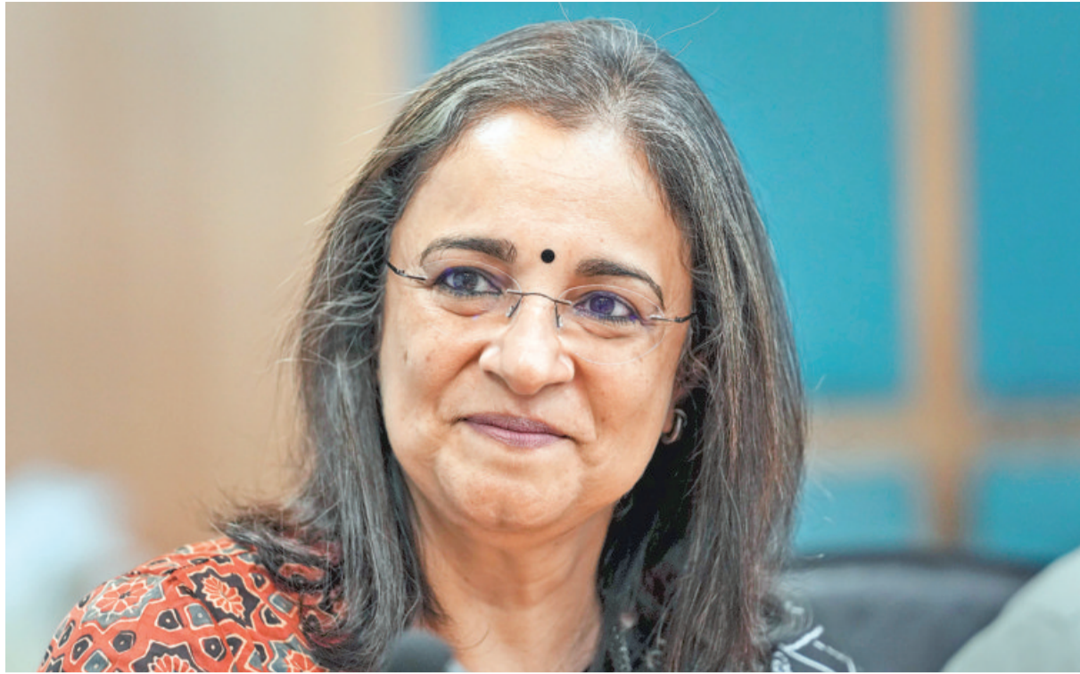
In December 2023, Sebi chief Madhabi Puri Buch (pictured) had said, "We feel that there is room for an additional asset class somewhere between mutual funds and PMS... Sebi is looking into a whole new asset class"

Currently, there is no structured product available to those who have a negative outlook. This drives them to derivatives, where only one out of 10 investors makes profits